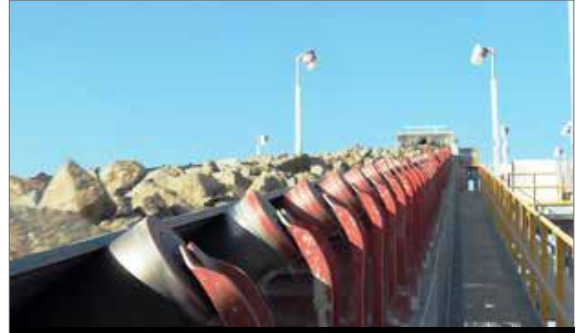
Large Material Lumps