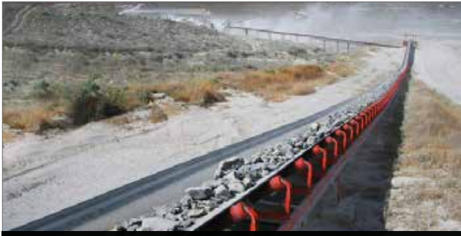
Sharp, Damaging Material