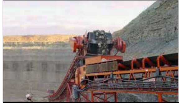
Extended Discharge Height