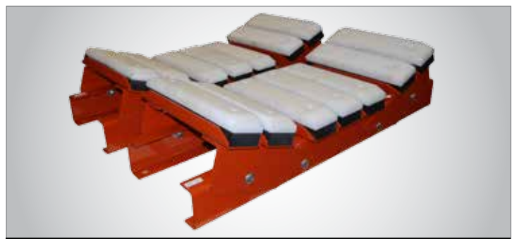
18" Impact Beds