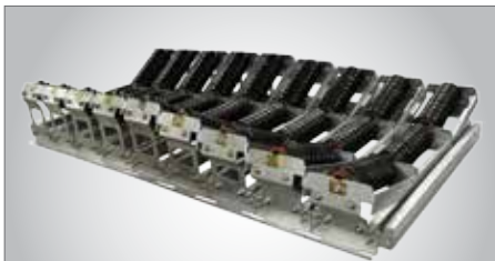
Fig 20.1 Specialty Impact Transition Bed