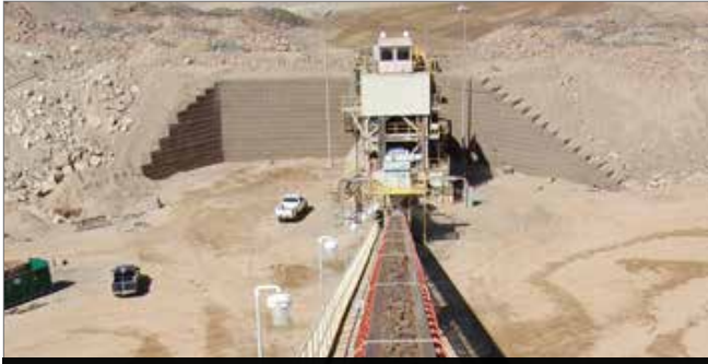
High Capacity Applications